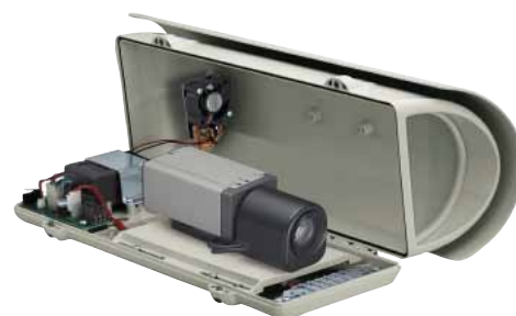
VERSO + CAMERA