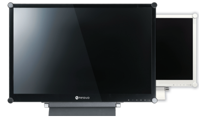
Available in black or white