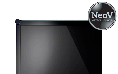
NeoV™ Optical Glass protects against scratches, impacts and other physical damage