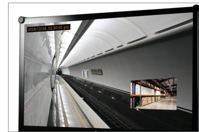
On top of PIP and PBP, Smart Omni Viewer offers selectable aspect ratios and the option of 180° image rotation